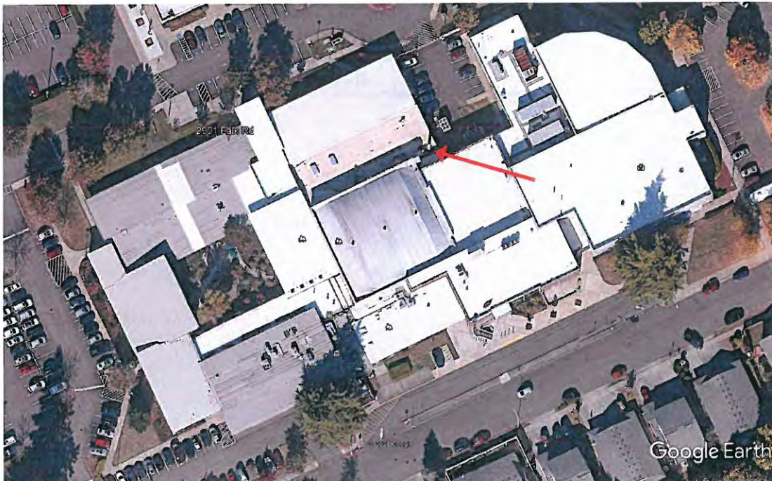
Google Earth Image – September 24, 2018