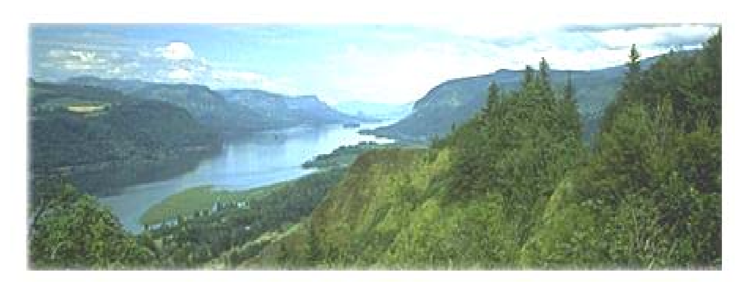
July 25, 2003

Developing a Regional Air Quality Strategy for the Columbia River Gorge National Scenic Area