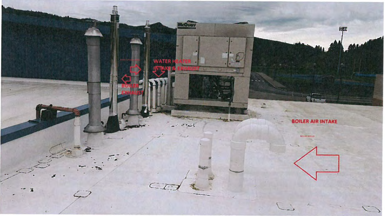
Kelso High School