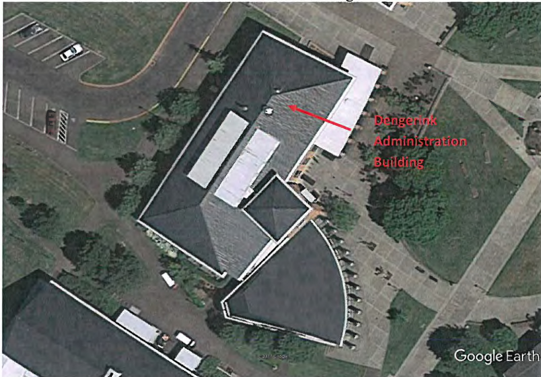
Google Earth Image – May 22, 2017

Boiler Identification: "VDEN Boiler #1" and "VDEN Boiler #2". Location: Dengerink Administration Building (VDEN) 14204 NE Salmon Creek Avenue, Vancouver, WA 98686-9600 On top floor boiler room – north half of building. Boiler Make/Model: Lochinvar Crest Series model FBN1001 Serial Number: To be determined Built: To be determined Installed: Expected October 2017 Burner: Pre-mix metal fiber burner Heat Input Rating: 1.000 MMBtu/hr with 20:1 turndown Fuel: Natural gas Stack Description: Discharging ~45' above grade and 5' above roof through ~6" diameter stacks on the north half of the building.